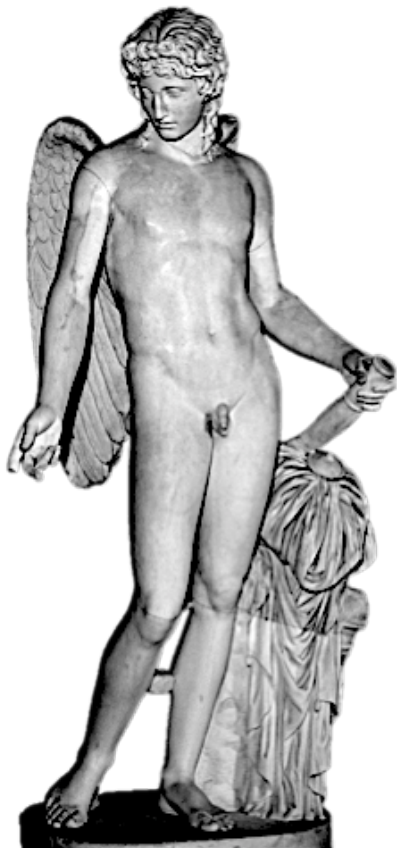
(Ερως - Ψυχή; Eros - Psíque)

Eros is a mysterious energy inherent in the whole of creation, fascinating seekers all over the world. Across the cultures, Eros takes different names but still remains the same agent that has to be awakened from within, since it is the only element that can transform the human psyche. Psyche has to be pacified and Eros "fire" has to be transformed into "light" so that he can become the mediator and guide that gently pushes and pulls the seeker towards the source of divine love. Eros the Beloved that awakens from within, guides and accompanies the seeker from within the inner planes. He is the inner witness, the agent within the seeker that unfolds gnosis, or divine knowledge. This divine knowledge awakens higher levels of consciousness within him and, in turn, these levels of consciousness aroused by Eros lead the seeker back to the source of light.