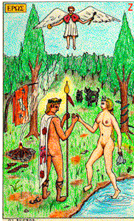
Los dos aspectos de Eros - Phanes / Eros - Carta 8 del Tarot Pítagórico : El Amante / Eros ( http://www.giurfa.com/tarot_pitagorico.pdf )